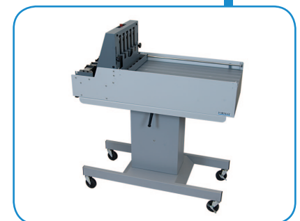
Optional V-Stack36 Vertical Stacker with adjustable-height stand